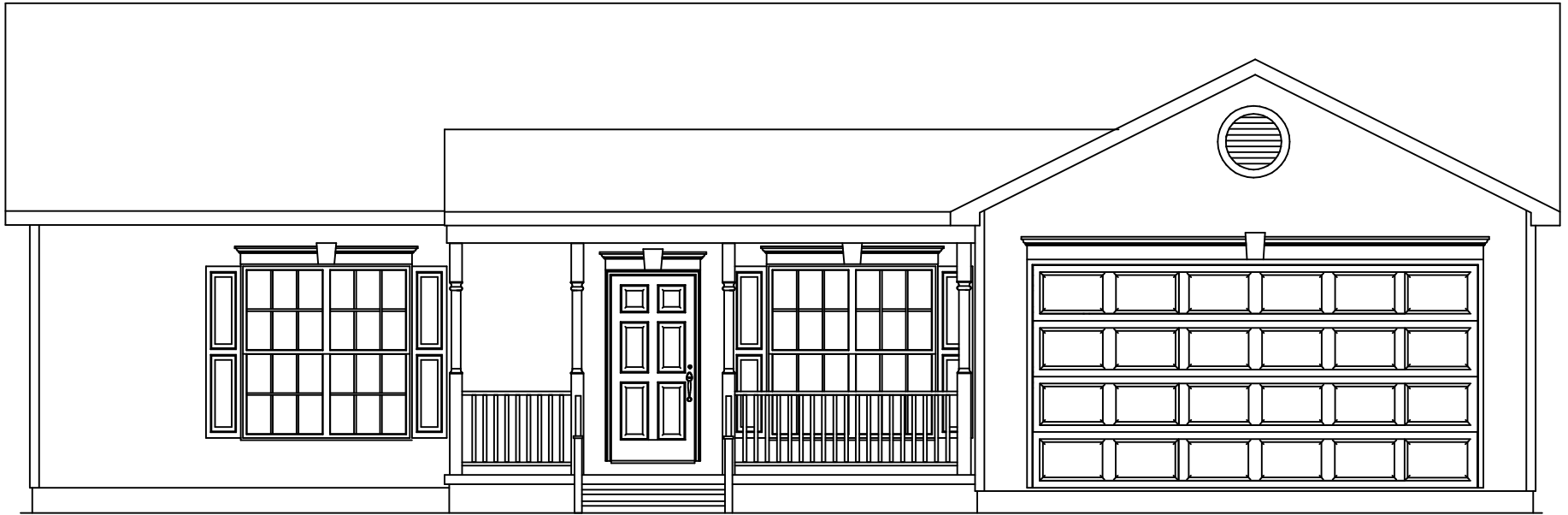
FRONT ELEVATION WITH GARAGE