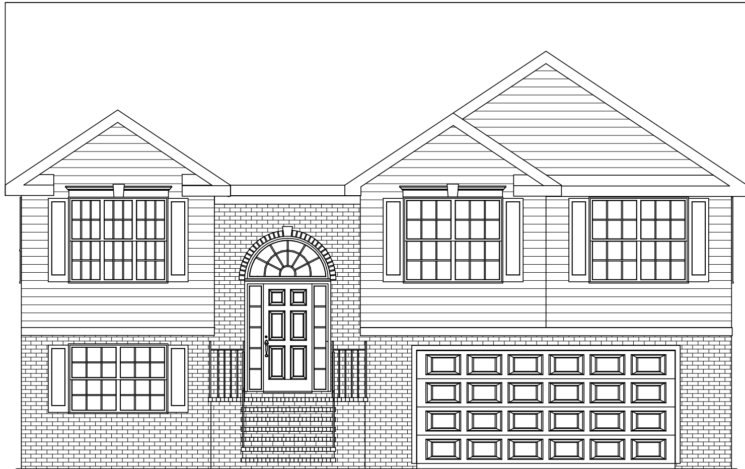
BRICK FRONT ELEVATION 001