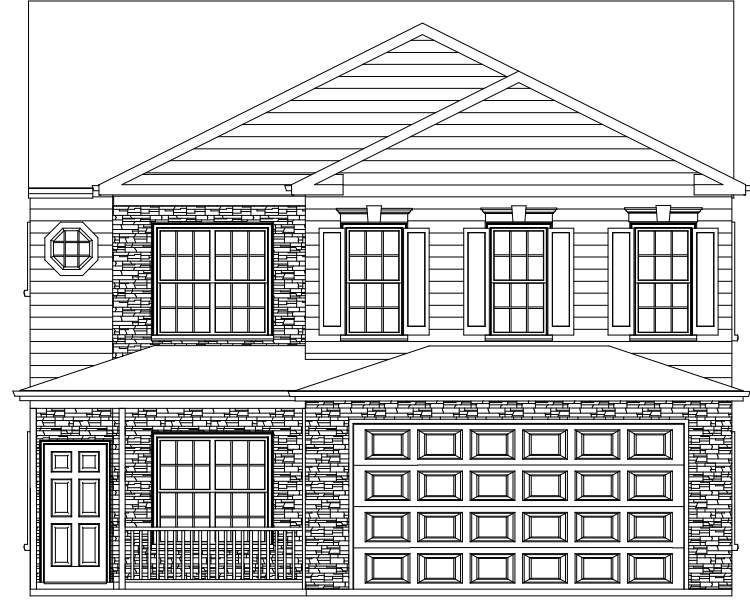
STONE ELEVATION MODEL CODE 260-002