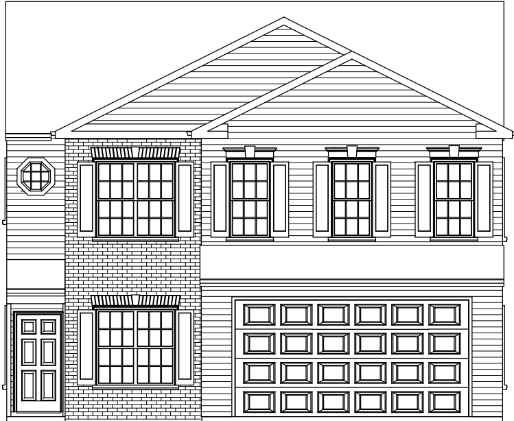
BRICK ELEVATION MODEL CODE 260-001