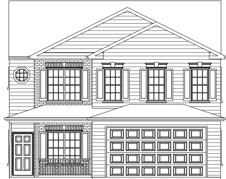
BRICK ELEVATION MODEL CODE 260-002