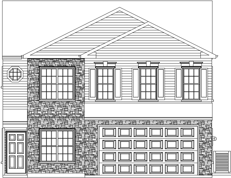
STONE ELEVATION MODEL CODE 260-001