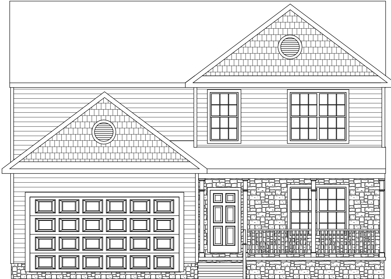
ELEVATION 003 WITH STONE