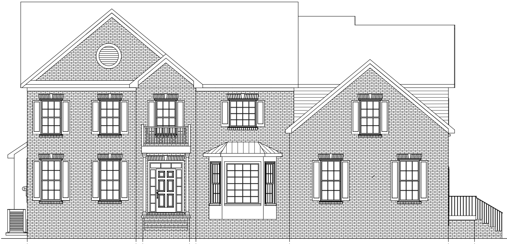
BRICK FRONT ELEVATION 001